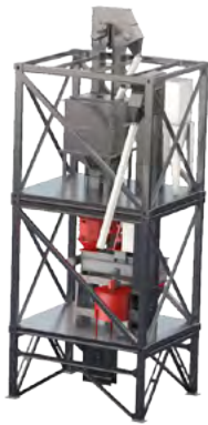
Seed treater CT 10 Aspirator Rotary valve Hopper with level sensor Mixing tank Conveyors