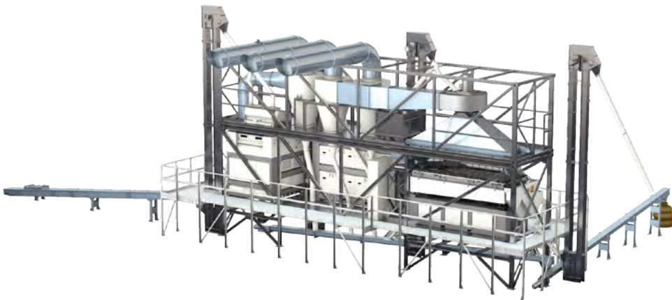
Air sifter P 12 Indented cylinder ZA 73 Gravity table G 40 Conveyors